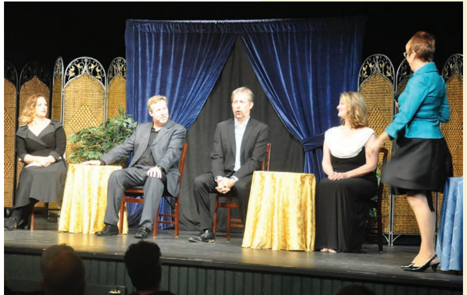
The Central City Opera in their September Performance

Throughout the year we also hosted a number of social events (including the combined Ouray-Ridgway high school prom), for a combined audience of approximately 8000 people. With such a wide variety of well-received events, we are realizing our goal of providing an important venue for both the performing and visual arts, education, and social life of our community.